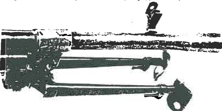
Mark I Bipod and Barrel - Note Extendable Bipod Legs

Method of Operation. After fitting a filled magazine, the bolt handle on the right side is pulled to the rear to cock the gun and then pushed forward again and locked down (the Mark I has a folding cocking handle). The change lever on the left side has three settings, "A" for automatic, "S" for safe, and "R" for repetition; this should then be set. Upon pulling the trigger and firing the first cartridge, the gas vent near the front of the barrel bleeds off gas to act upon the piston (the usual gas regulator setting is No. 2 and there are four different port sizes) and moves the piston rearwards, acting on the piston post and breech block. These are driven to the rear, extracting and ejecting the fired case. A spring in the butt then returns the mechanism, picking up a fresh cartridge and chambering it.