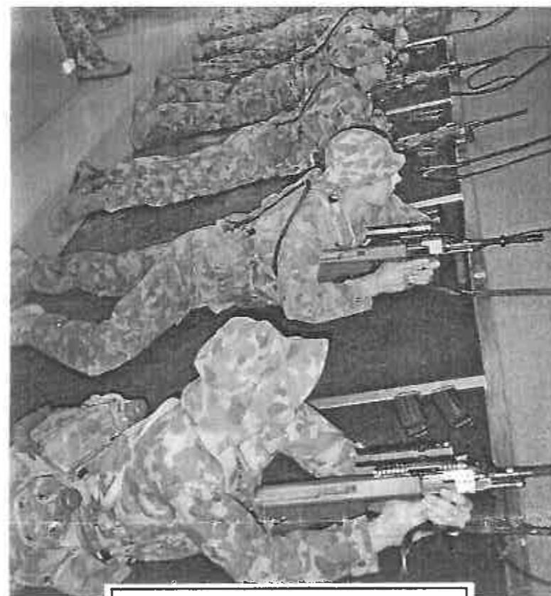
9RQR soldiers at the ready with their styres at the Weapons Training Simulation system STEEL TUFF 2004