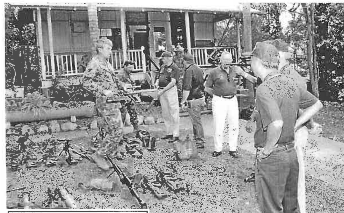
The RSM explains the workings of some of today's infantry weapons.