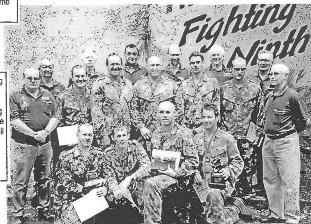
Enoggra Barracks—October 2004