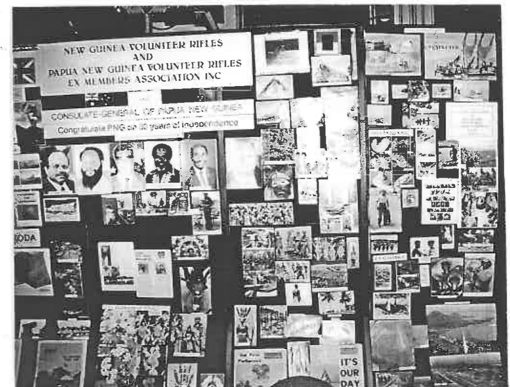
Part of the display set up by John Holland at the PNG Consulate for the 30th Independence Anniversary function on the 15 September 2005.