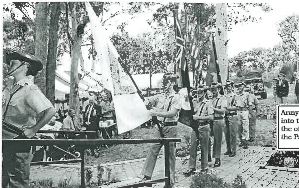
Army Cadets march the flags into the Soldier's Chapel for the official opening. Includes the Papua New Guinea flag.