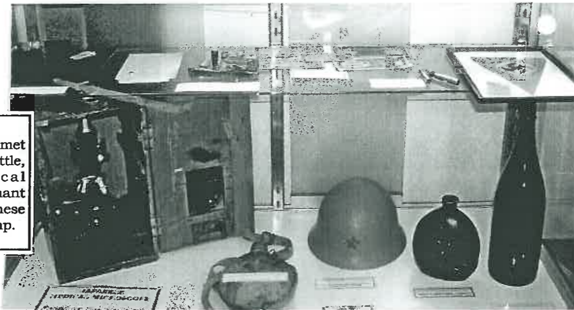
Display Items Includes Japanese helmet and water bottles, Saki bottle, a Japanese medical microscope, Nazi Pennant found in Lae and a Japanese officer's personal seal stamp.