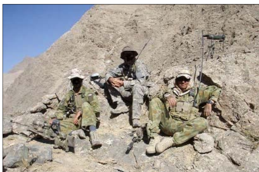
SAS soldiers in Afghanistan

One of those wounded this time was an Afghan interpreter, who was badly hit in the head and thrown out of the vehicle – and saved by Trooper Mark Donaldson who was later awarded the Victoria Cross for his actions. Four other gallantry medals were be awarded for surrounding events, including a Medal for Gallantry to the Aussie who took control of the lead vehicle.