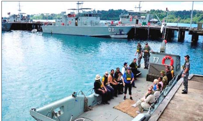
Detention Centre Staff aboard an Australian Landing Craft at Lombrum 2013.