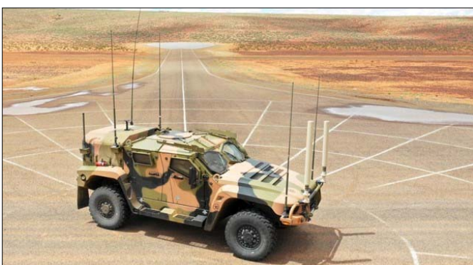
An Australian Army Thales Hawkei protected mobility vehicle-light photographed at a purpose-built facility near Woomera in South Australia where Army is running Protected Mobility Integration and Capability Assurance program testing.