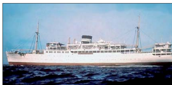
Burns Philp Ship TSMV "Bulolo"

Mirani and then there was the Bulolo . The Malekula had 8 letters. Source The Ship's List