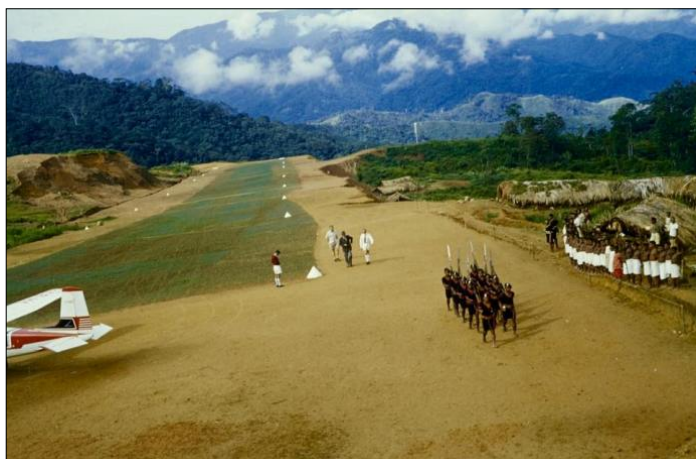
An unknown airstrip in the Highlands of PNG. Typical drop off at one end and probably a steep cliff at the other with a few bumps in the middle. Strip probably has a slope as aircraft parked sideways. Obviously a VIP arriving with the Police guard and Administration personnel dressed in their white lap-laps. Photo taken prior to 1964 as the Police are dressed in their old uniform.

Mirani and then there was the Bulolo . The Malekula had 8 letters. Source The Ship's List